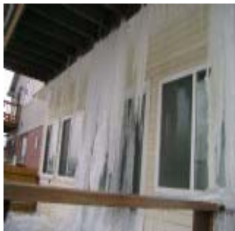
Burst Frozen Pipes.

Water damage is progressive and items that could be restored or dealt with within the first 48 hours of the water damage may not be restored if emergency response is delayed. Although you might be tempted to use a shop vacuum or call a company that only has